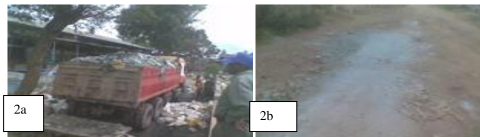
Figure 2 – (2a) a vehicle overloaded with wastes.(2b) chrome droppings observed along the road from Aziz tanneries limited.

organs posing a serious threat to public life of present and future generation who might come in contact with the tannery based solid wastes.